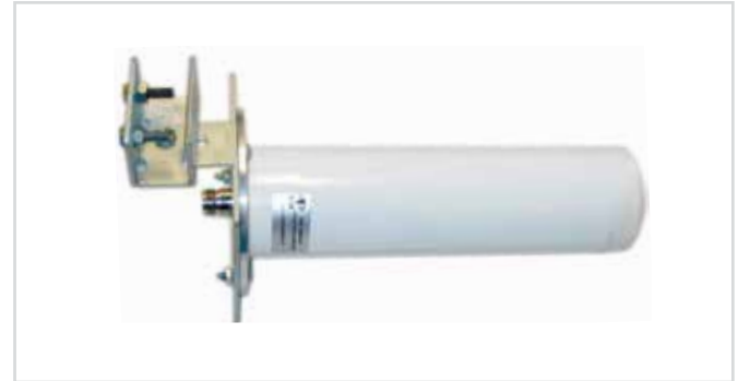
Dual Band Omnidirectional Antenna